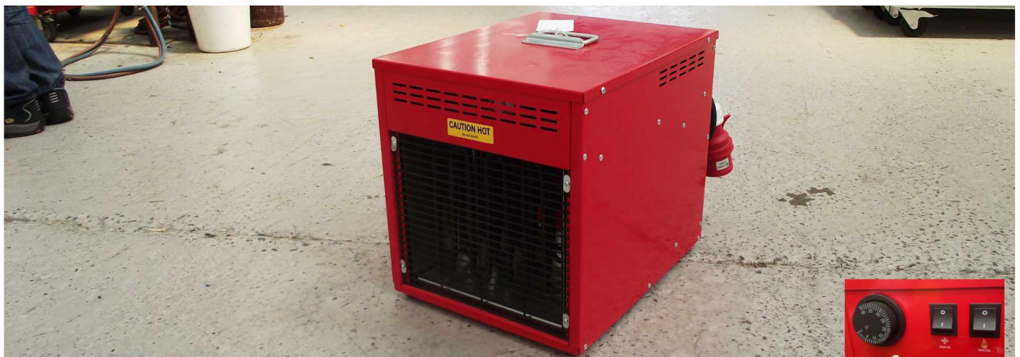
FF12 & FF23 offer a cost effective heating solution